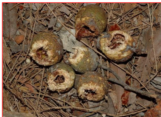
Marri nuts chewed by Carnaby's Cockatoo