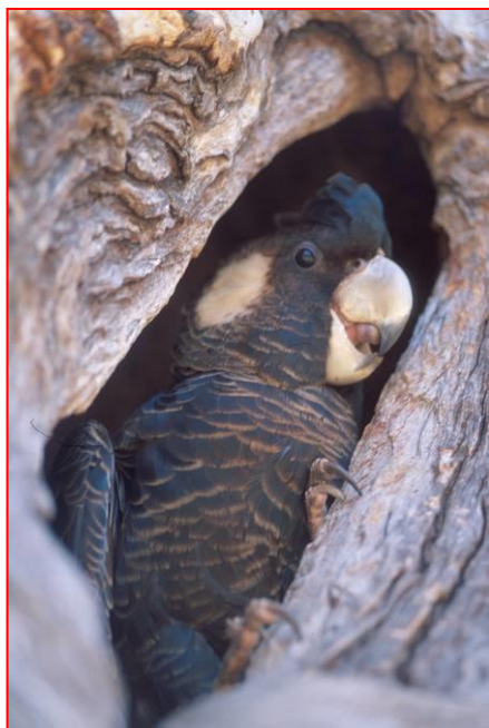
Female Carnaby's Cockatoo at nest