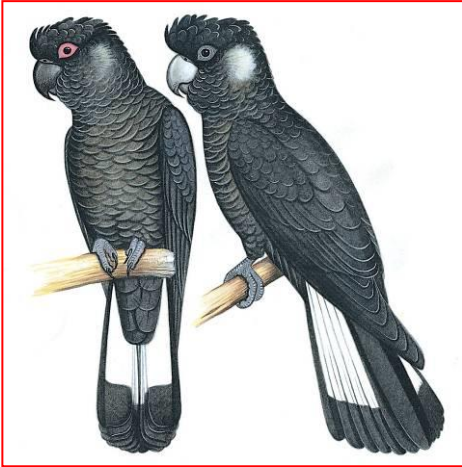
Male (left), Female (right)